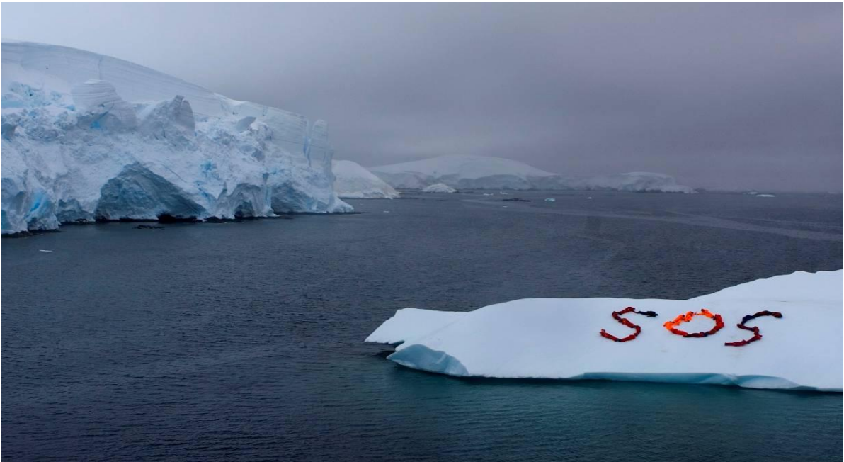
The crew from the expedition boat for Global Green and Green Cross International spell out SOS on an iceberg in Gerlache Strait, Antarctica.